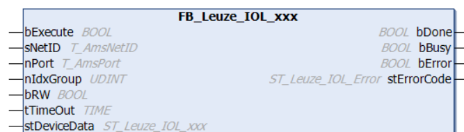
Fig. 3.1: Example of module call